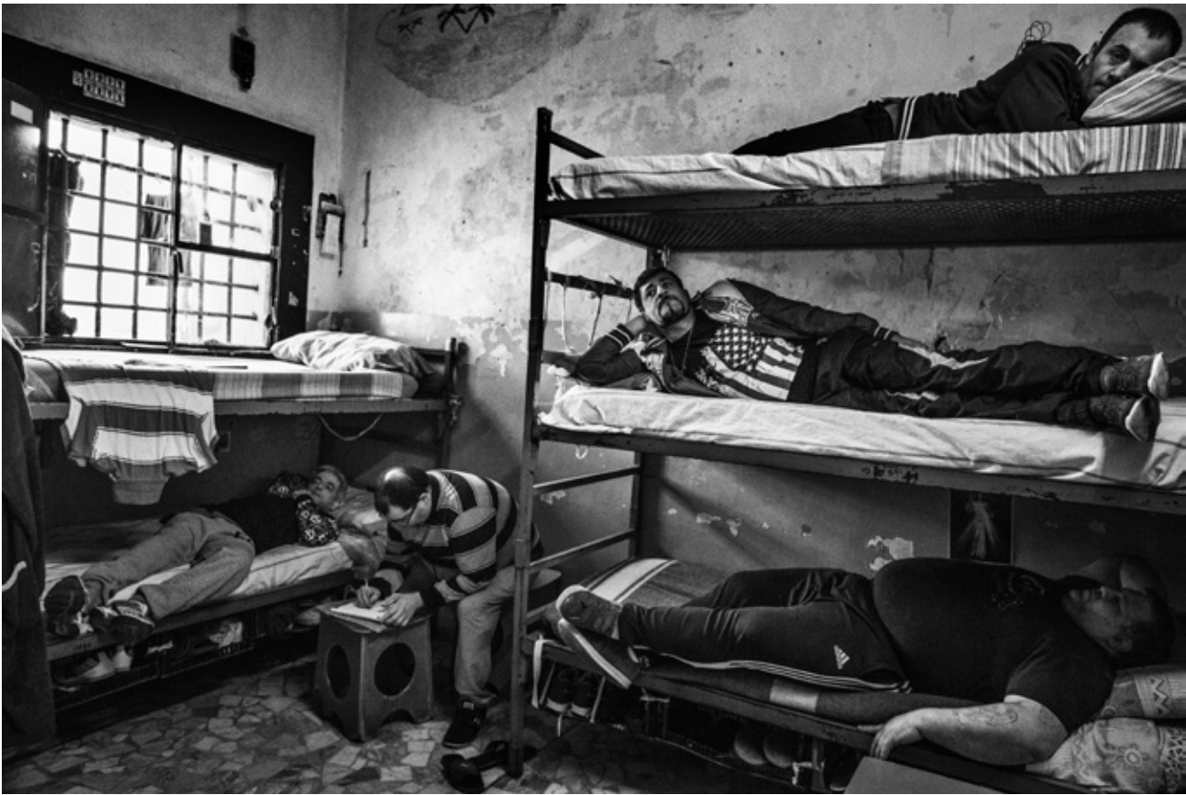
Cells of Naples' Poggioreale Prison, Oct. 9, 2019.