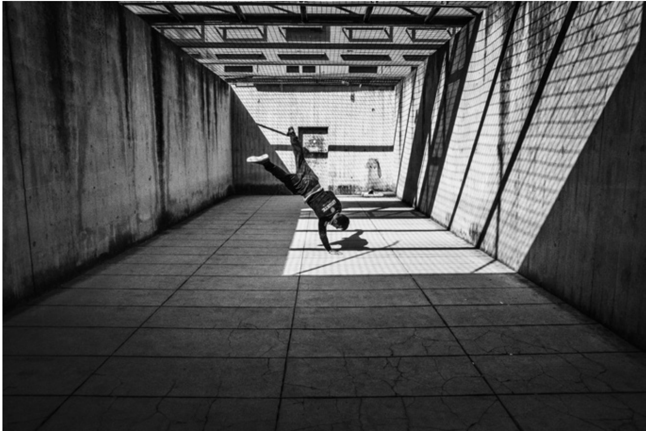
Somersaults in Palermo's Ucciardone Prison, Dec. 10, 2019.