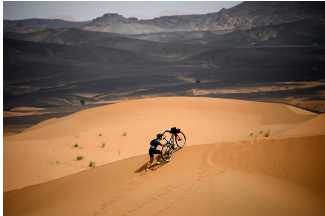
A competitor pushes a bicycle along a sand dune during Stage 2 of the 14 th Titan Desert mountain biking race between Merzouga and Ouzina on April 29, 2019.