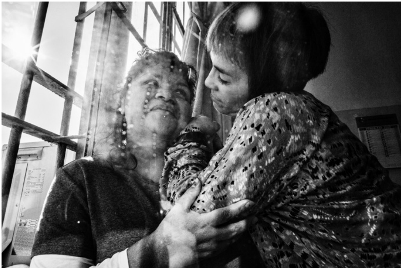
Affection in Milan's San Vittore Prison, Dec. 11, 2019.