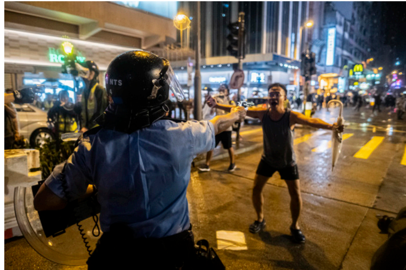
A man clutches a furled umbrella in one fist as he spreads his arms in a plea for mercy, facing down the barrel of a pistol drawn by a Hong Kong police officer at Tsuen Wan, Hong Kong, Aug. 25, 2019.