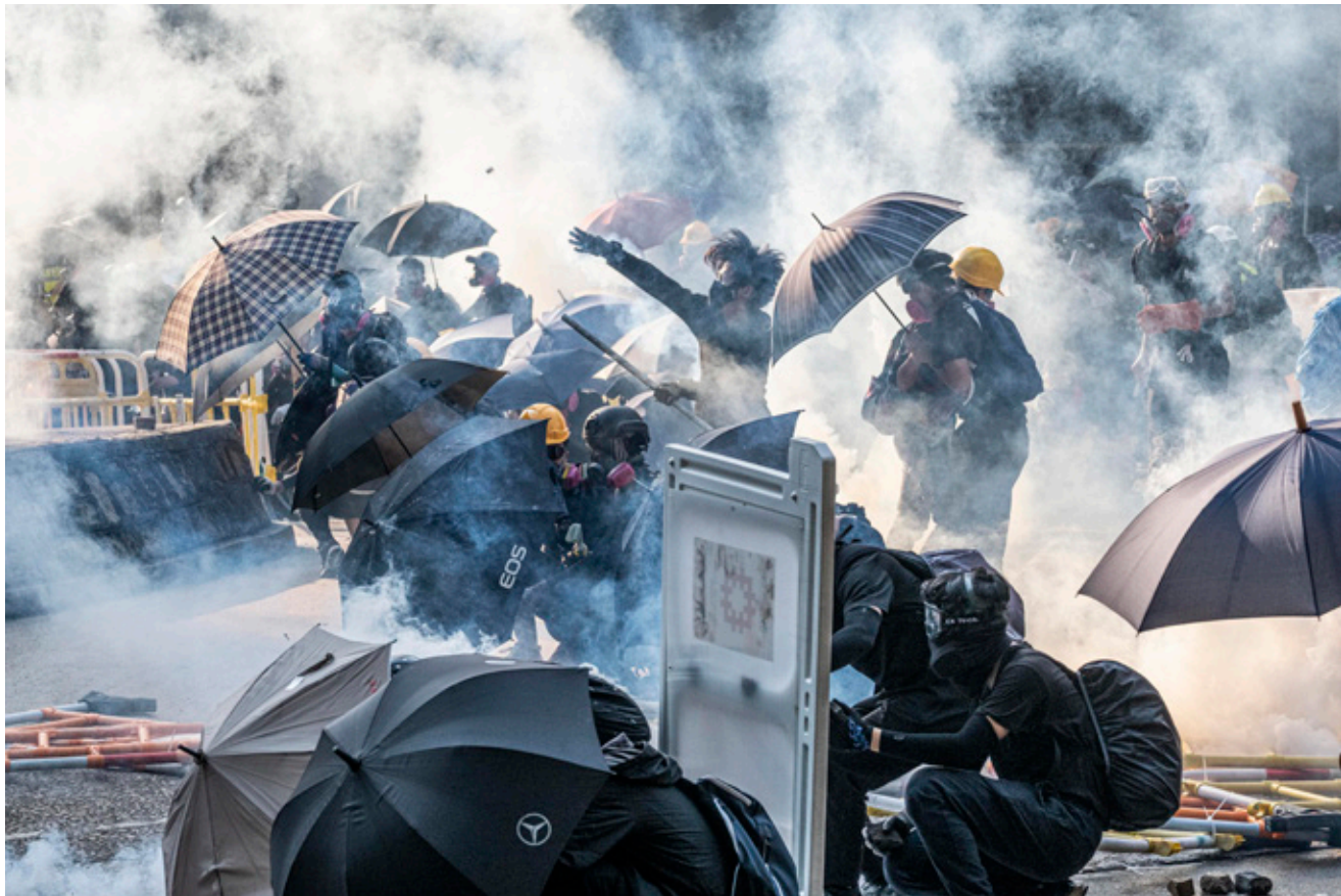
Amid tear gas, protestors and riot police clash near Wong Tai Sin M.T.R. station in Hong Kong Oct. 1, 2019, the 70 th anniversary of Communist Party rule in China.