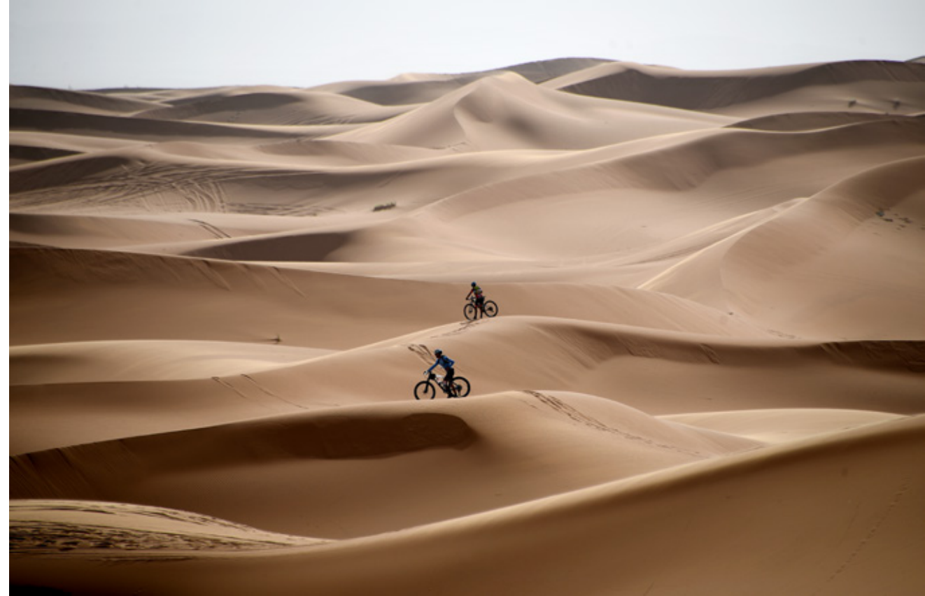
Competitors ride bikes along sand dunes during Stage 1 of the 14 th Titan Desert mountain biking race around Merzouga, Morocco on April 28, 2019.