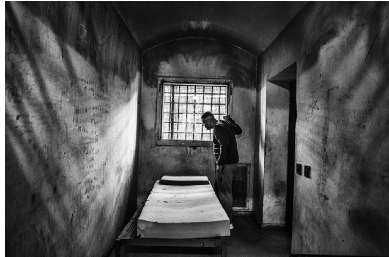
Looking out from Rome's Regina Coeli Prison, Dec. 3, 2019.