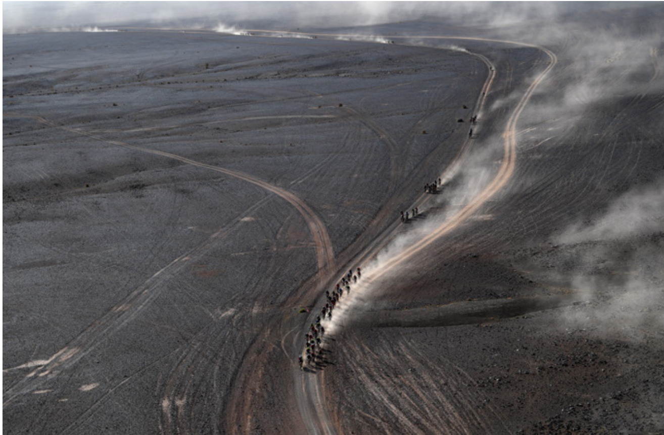
Competitors ride bikes during Stage 4 of the 14 th Titan Desert mountain biking race between Merzouga and M'ssici, Morocco on May 1, 2019.