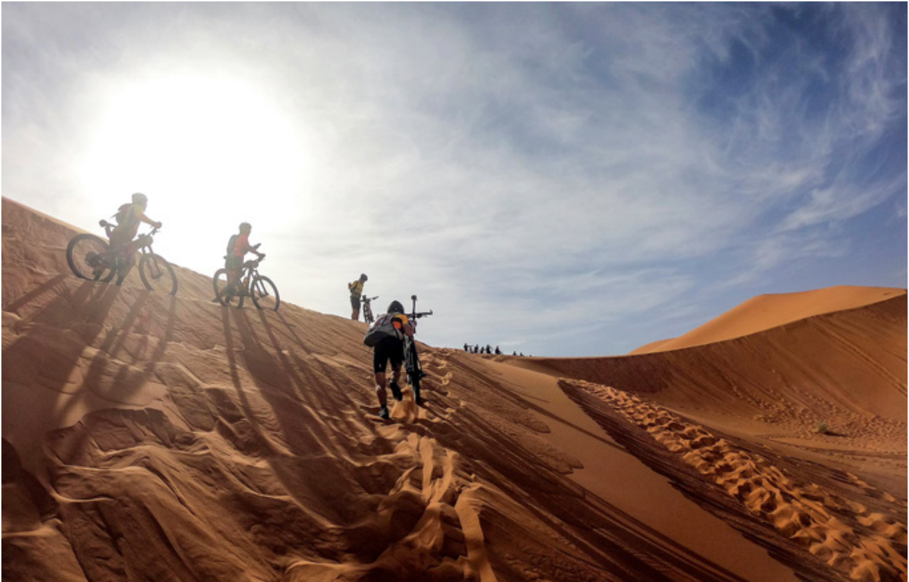
Competitors climb a sand dune during Stage 1 of the 14 th Titan Desert mountain biking race around Merzouga, Morocco on April 28, 2019.