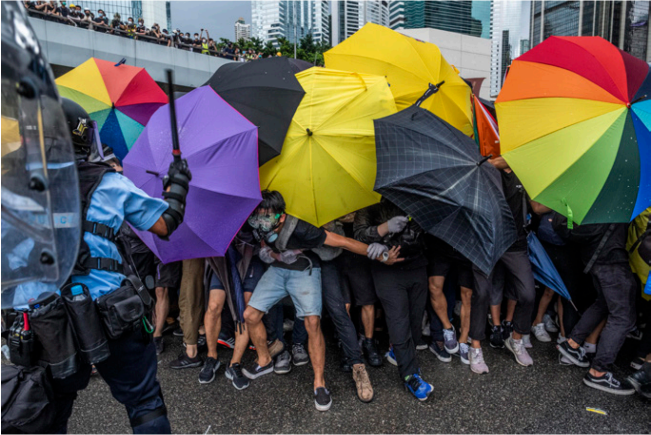
Protesters clash with riot police officers at Wan Chai, Hong Kong July 1, 2019, before flag-raising ceremony for the 22 nd anniversary of Hong Kong's return to Chinese rule.