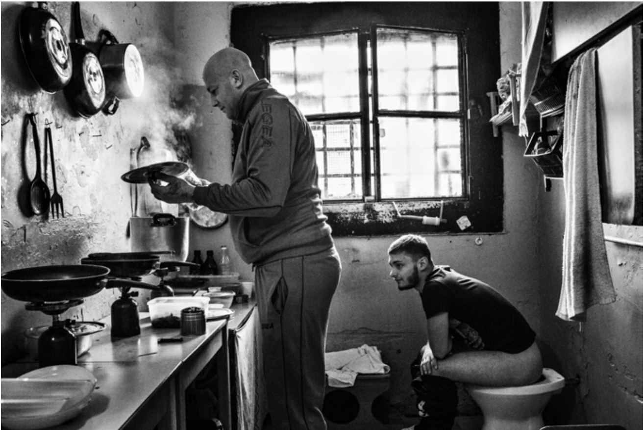
No privacy in Naples' Poggioreale Prison, Dec. 10, 2019.