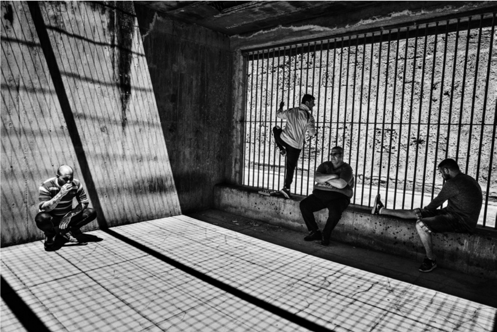
Story News / 1 st Prize Winner Valerio Bispuri / Italy Prisoners / Italy