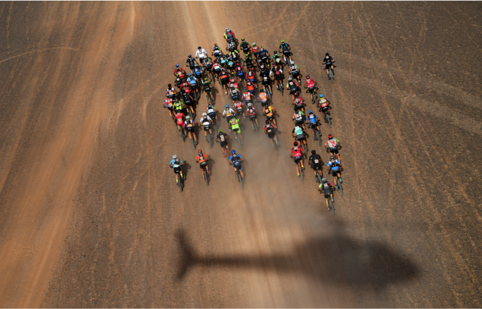
Competitors ride bikes during Stage 4 of the 14 th Titan Desert mountain biking race between Merzouga and M'ssici, Morocco on May 1, 2019.

France Titan Bike Race / Morocco