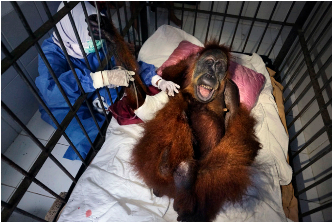
After surgery, Hope is placed on a bed in a low cage to restrict her movements while her collarbone (clavicle) heals. She was rescued totally blind and with 74 air rifle bullets in her body. March 17, 2019.