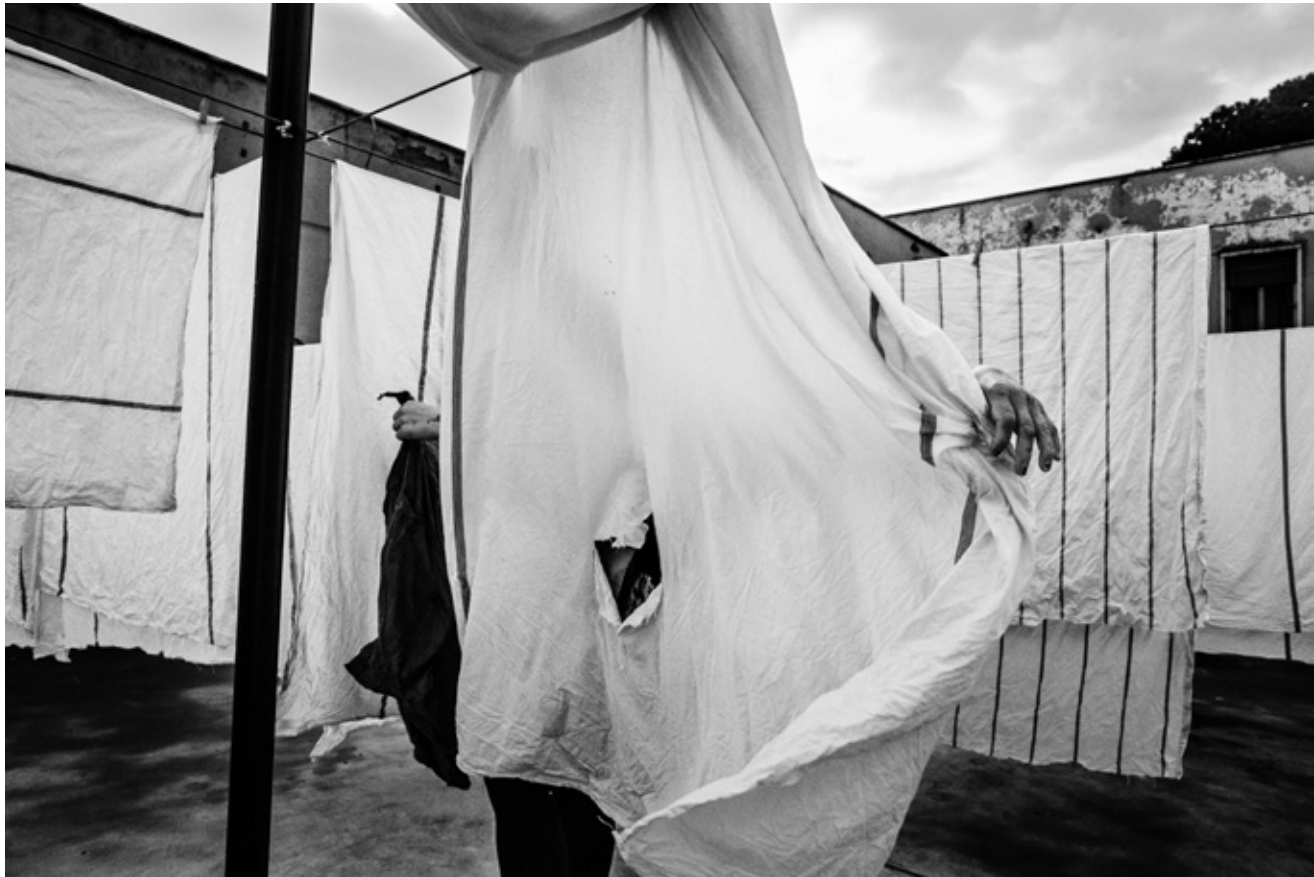
Bed sheets in Rome's Rebibbia Prison, Feb. 7, 2019.