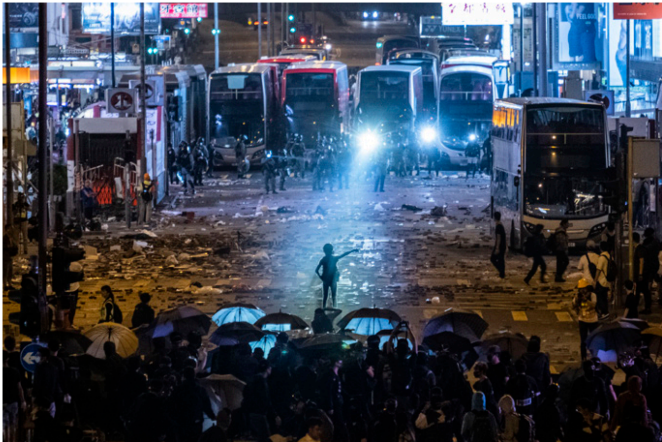
In the Mong Kokon district on Nov. 11, 2019, protesters and the police form tight lines in a tense standoff illuminated by stark, bright lights the officers shine on the demonstrators.