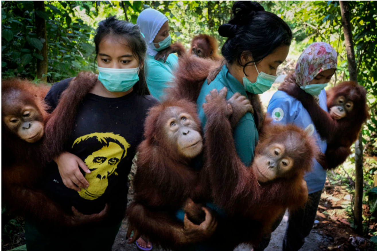
Substitution mothers on the way to the forest school with orphaned orangutans. They will teach them to climb trees. It is the first step in a teaching, socialization, and rehabilitation program. Jan. 22, 2019.