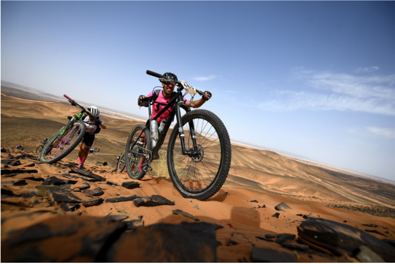
Competitors push their bicycles during Stage 2 of the 14 th Titan Desert 2019 mountain biking race, between the cities of Merzouga and Ouzina, Morocco on April 29, 2019.