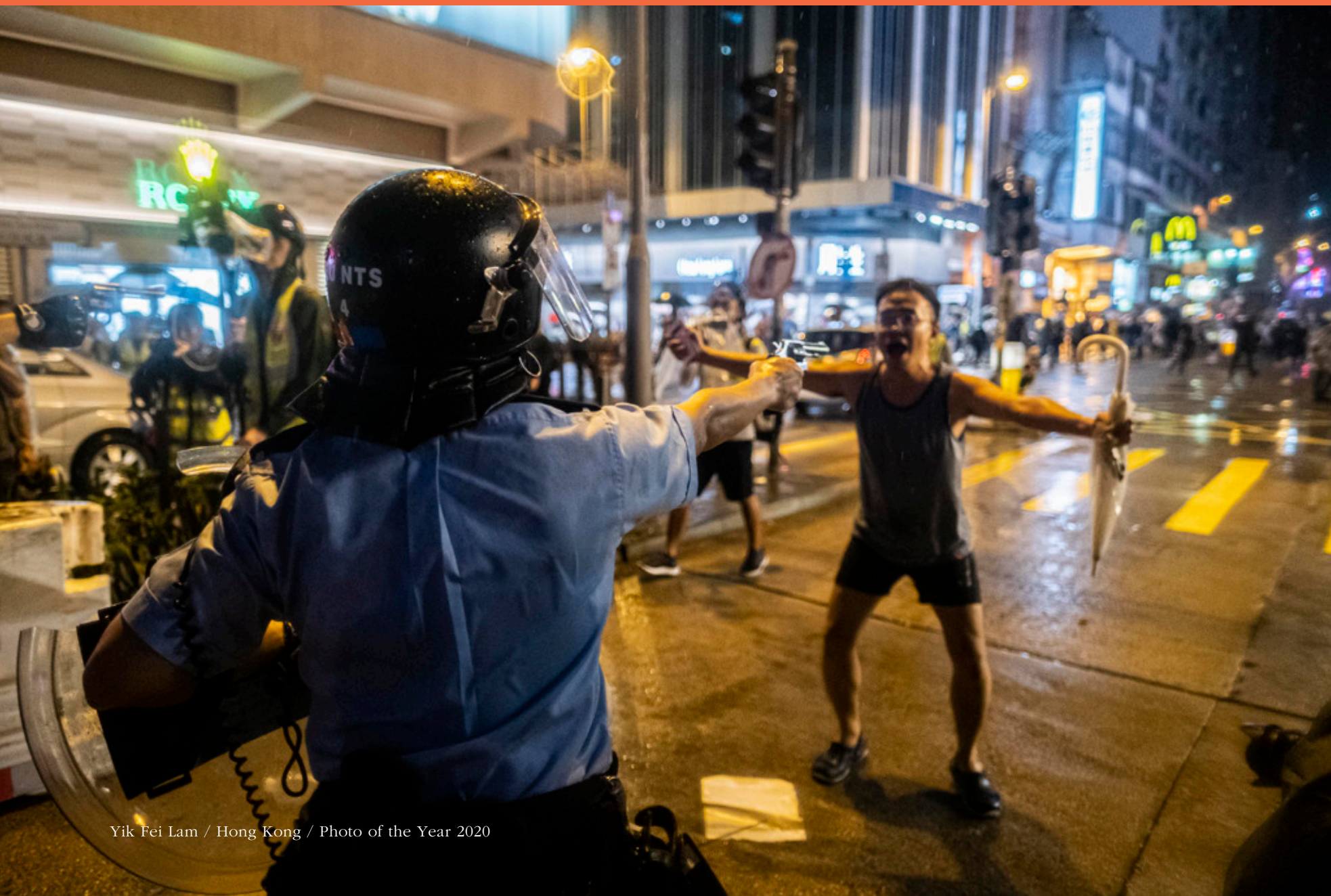
Yik Fei Lam / Hong Kong / Photo of the Year 2020