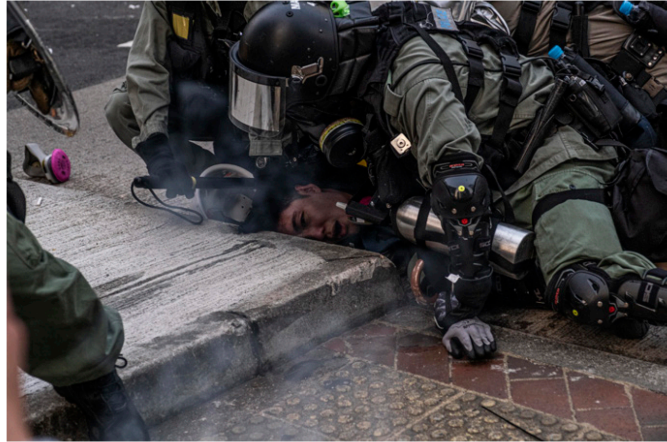
On Sept. 29, 2019, officers pin a protester to the ground in clashes near government offices in Hong Kong.