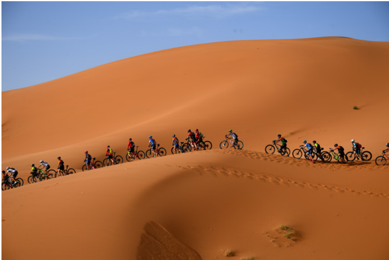
Competitors ride bikes along sand dunes during Stage 1 of the 14 th Titan Desert mountain biking race around Merzouga, Morocco on April 28, 2019.