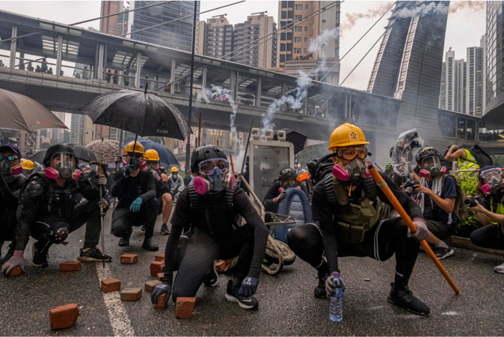
Protestors clash with riot police after a march at Tsuen Wan in Hong Kong, Aug. 25, 2019.

Story News / 2 nd Prize Winner Yik Fei Lam / The New York Times - Hong Kong Hong Kong Protests / Hong Kong