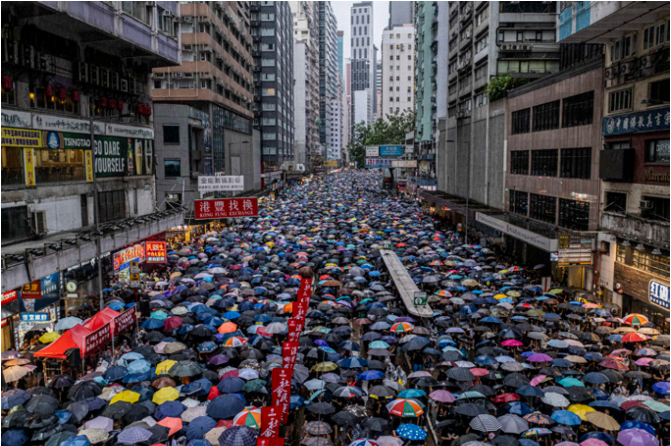
Thousands of people march in Victoria Park, Hong Kong, Aug. 18, 2019.