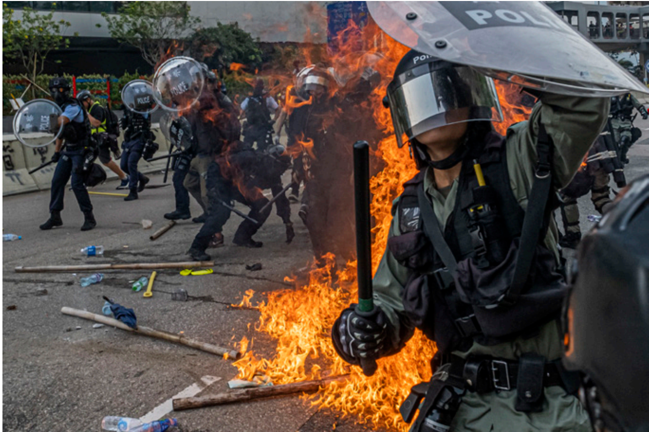
Protesters clash with riot police at Kowloon Bay, Hong Kong Aug. 24, 2019.