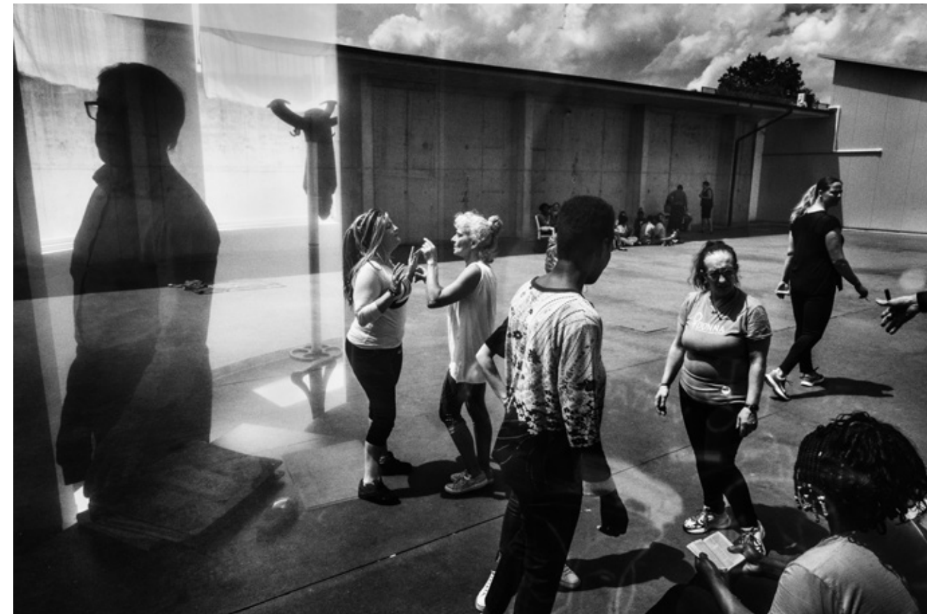
Prison yard of Rome's Regina Coeli Prison, Sept. 12, 2019.