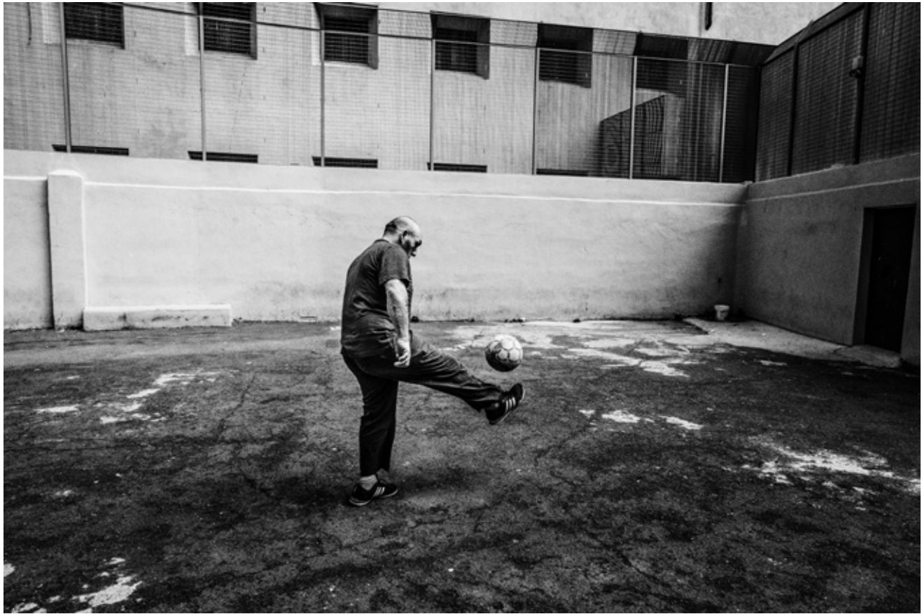
Just a ball in Rome's Regina Coeli Prison, July 11, 2019.