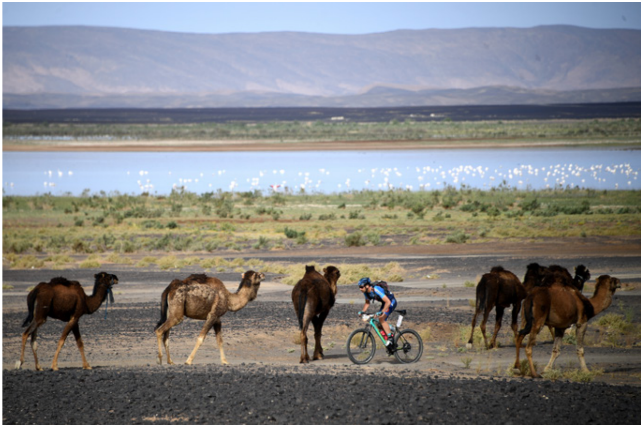
A competitor rides his bicycle among camels during Stage 2 of the 14 th Titan Desert 2019 mountain biking race between the cities of Merzouga and Ouzina, Morocco on April 29, 2019.