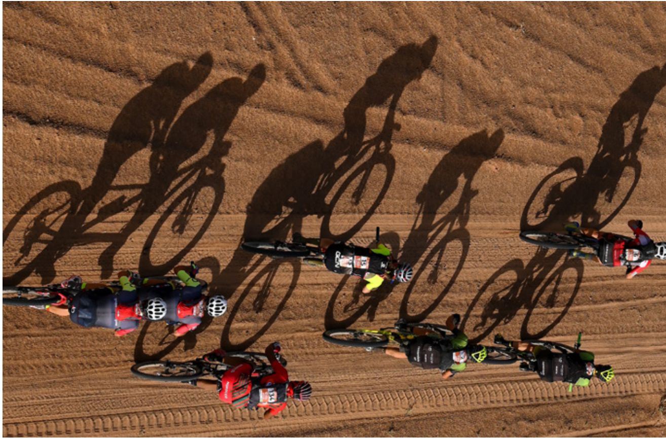
Competitors ride bikes during Stage 4 of the 14 th Titan Desert mountain biking race between Merzouga and M'ssici, Morocco on May 1, 2019.